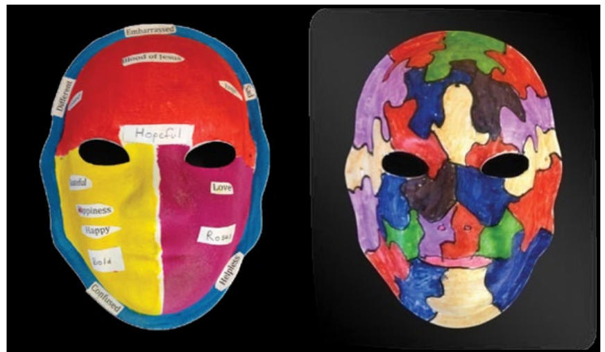
Unmasking Brain Injury is a global brain injury project started by Hinds' Feet Farm.